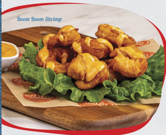
Boom Boom Shrimp

Twelve grilled or hand battered shrimp drizzled in our house made Boom Boom wing sauce. (Double the Shrimp for $6)