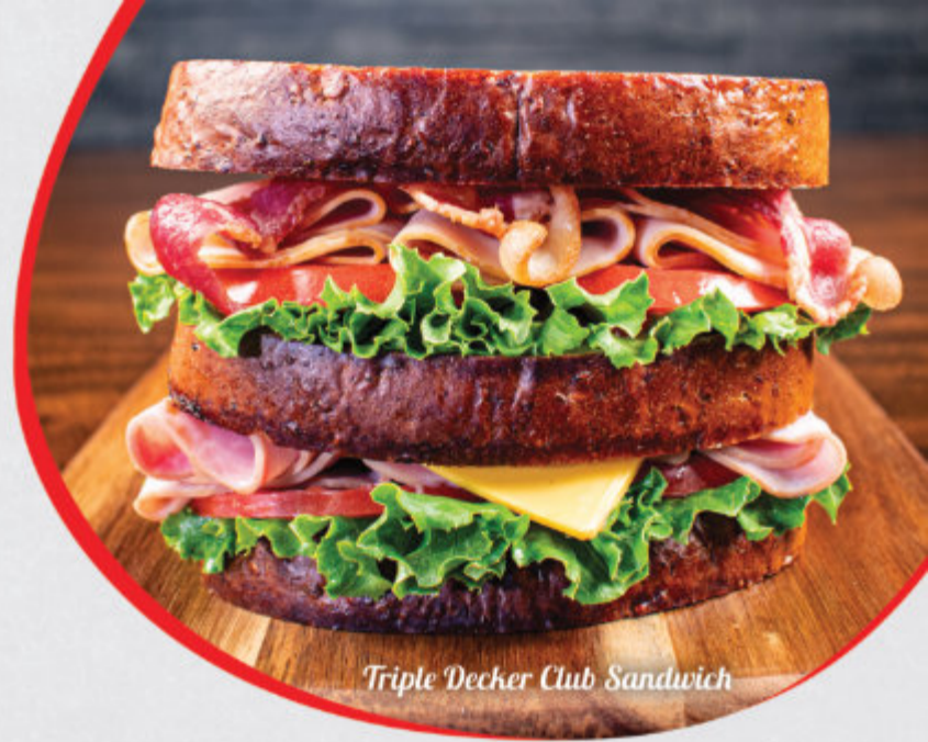
Triple Decker Club Sandwich

Thinly sliced corned beef or turkey topped with Swiss cheese, sauerkraut, 1000 Island dressing and mustard on toasted Rye.